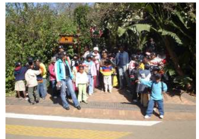
Aftercare Children at the ZOO

"There is no place like this place anywhere near this place, so this must be the place"