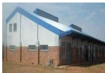
Above: : Region 11 centre in E/dale

Conquest For Life opened its first office in Ennerdale in January 2002 at the Ennerdale Civic Centre. After several meetings with the Ward Councillor, Ward Committee and the than Region 11 Council of Johannesburg. Upon approval from the council, Conquest For Life moved into a premises in Ennerdale Extension 9.