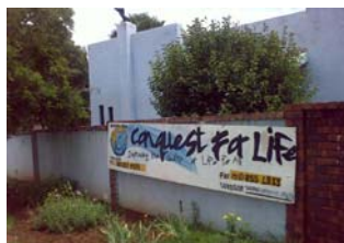
Above: CFL office in Ennerdale

During 2005 we explored various options for space. Conquest For Life bought a house in Allie Crescent