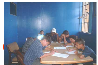
Above: Building Bridges Diversion Project in session.

The project consists of the following components - Life skills, Development and Counselling, Capacity Building, Mentorship, etc. The Reathusana Project also focuses on mending the wounds that were caused by the nature of the offence.