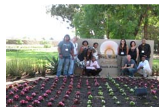
Above: :The Ashoka Team

and a tree planting celebration with Wangari Maathaihe. Kelly Rowland was so gracious and was taken in by the good work done by Ashoka Fellows.