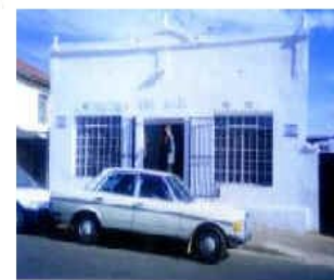
Where it all began .... 32b Steyler Street, Newclare

They lack the exposure and the vision to believe that positive change can happen in their lives. Many fall prey to a life of crime or to a generational cycle of poverty and despondency. Anger and frustration are released anti-socially through random acts of violence, gang affiliation, crime, drug, and alcohol abuse. Many of the young people have difficulty adjusting to school and drop out before matriculation. As a result they lack the life skills needed to ad-