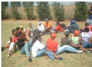
Above: Young people participating in experiential learning.

Conquest For Life opened its first office in Ennerdale in January 2002 at the Ennerdale Civic Centre. After several meetings with the Ward Councillor, Ward Committee and the than Region 11 Council of Johannesburg. Upon approval from the council, Conquest For Life moved into a premises in Ennerdale Extension 9.