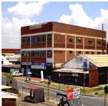
Above: Conquest For Life's Head Office in Newclare / Westbury