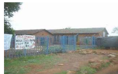
Next: Where it all began in Zola / Soweto—Bridgement Centre

Due to the same issues and challenges as in Ennerdale, Conquest For Life made a decision to focus on our identity and branding. Late 2006, Conquest For Life bought a house in Meadowlands, Zone 9 and we will operate from the house. The idea is to create our own identity and profile in Soweto.