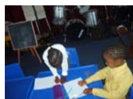
Top: Children helping each other in the aftercare.