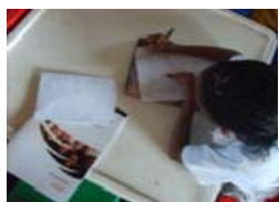
Left: One of the children in the Aftercare doing homework

I Commit myself to my school work. I Commit myself to me. I Commit myself to life. I Commit myself to love others. I Commit myself to Jesus. I Commit myself to be the best me,