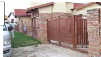
Next: The Conquest For Life office in Meadowlands/ Soweto