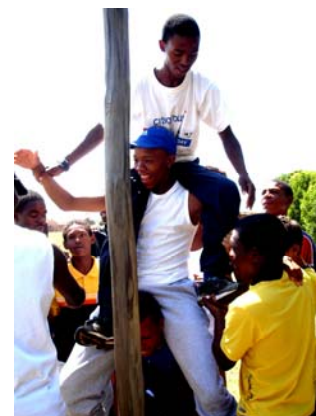
Participants during Peace Games at the Diversion Camp

Today Computer Training, Diversion for the young criminals and the Young Mothers programme has been added to their list of commitments.