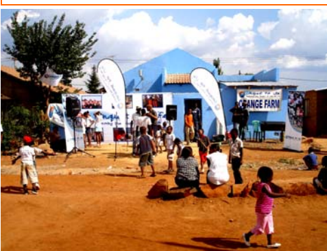
The launch of the Orange Farm branch on 03 March 2007