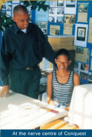
At the nerve centre of Conquest

With strong community goodwill and support, Conquest for Life sought SSACI's support for a job-creation project to provide 100 youths with technical, entrepreneurial and life skills. The aim is to provide disadvantaged young people with skills which could help them find jobs and to provide young entrepreneurs with the skills to start up their own small businesses. More specifically, the project teaches skills such as electrical appliance repair and house wiring, upholstery, detergent production and small business development in general.